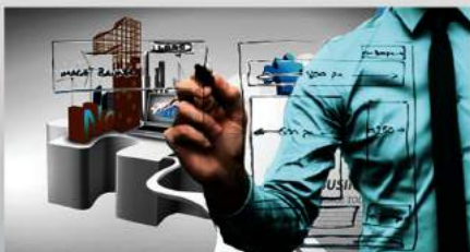
Designers and engineers